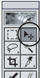
The MOVE tool

2. Drag your the elements into your chosen background image using the MOVE tool. Click on the layer in the layer palette, or in the selected image with the move tool, and DRAG it (holding down the mouse button) to the chosen background image.